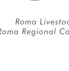
Roma Livestock Exchange, Roma Regional Council (2010)