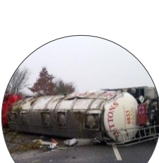
Road Safety Advice on Tanker Rollover, Allianz Pty Ltd (2003)