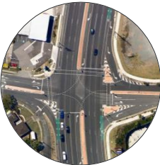
Eatons Hill Shopping Centre, Department of Transport and Main Roads (2011)