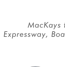
MacKays to Peka Peka Expressway, Board of Inquiry (NZ) (2012)