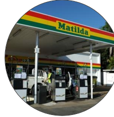
Fatal Truck Crash on the Bruce Highway, Shine Lawyers (2012)