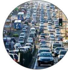
Everton Park Shopping Centre, Yu Feng Group (2013)