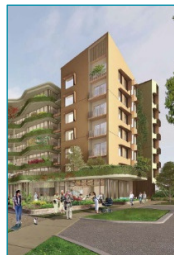
Nundah Lutheran Aged Care Facilities with RPS Group for Lutheran Services (2014-ongoing)