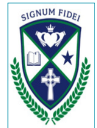
Ambrose Treacy College Master Plan Indooroopilly with Fulton Trotter Architects (2012-2017)