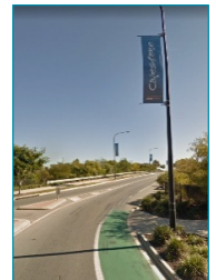
Capestone Residential Estate, Urbex (2012-ongoing)