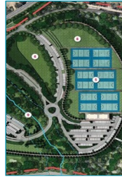
Northern Gold Coast Sports and Community Precinct in Pimpama for the City of Gold Coast (2017)