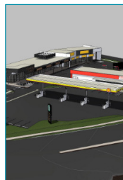
Ashmore Mixed-Use Commercial and Light Industrial Centre on the Gold Coast for Empirica Developments (2015-2018)