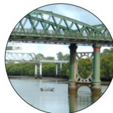
Brisbane to Cairns Corridor AUSLINK Review, Main Roads (2006)