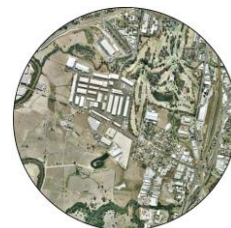
Sherwood-Yeerongpilly Freight Study, Brisbane City Council (2008)