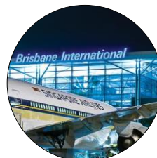
Brisbane Airport Strategic Master Plan, BAACL (2008)