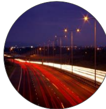
Centenary Motorway Area Transport Strategy, Main Roads (2011)