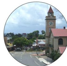
Cooloola Priority Infrastructure Plan (2011)